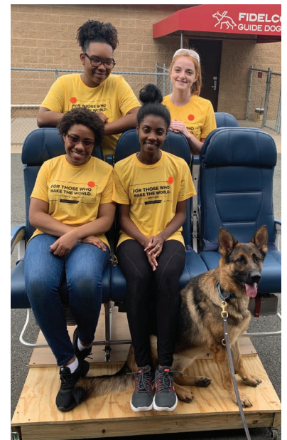
Stanley Black & Decker employees test out the airline seat base they helped to build.

For more information about volunteering and fundraising on behalf of Fidelco, please contact Tricia Rowold at trowold@fidelco.org or 860.243.5200 x4801.