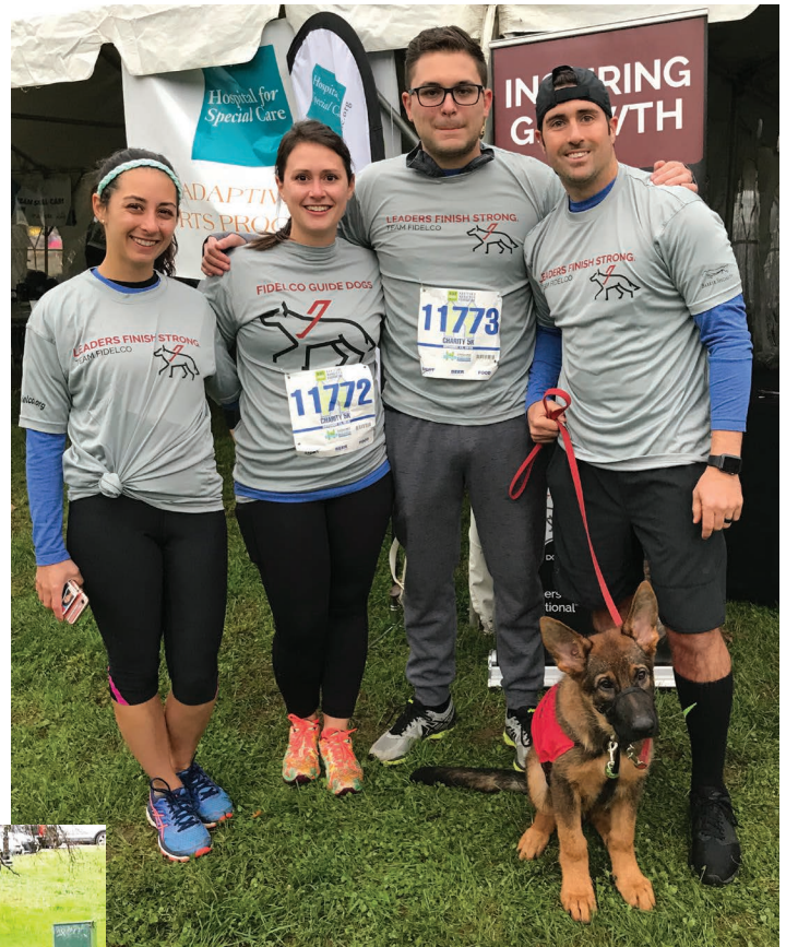
Above: Team Fidelco walkers and runners with Fidelco guide dog puppy "Keating."