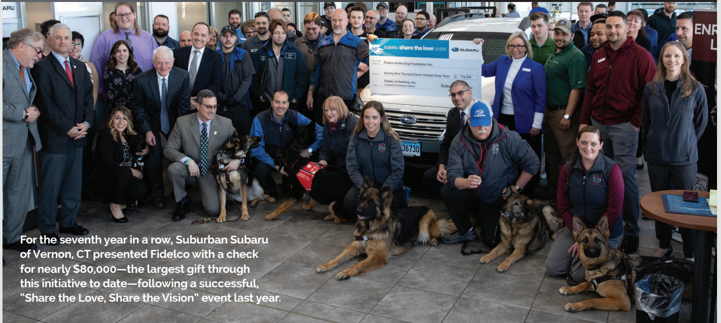
For the seventh year in a row, Suburban Subaru of Vernon, CT presented Fidelco with a check for nearly $80,000—the largest gift through this initiative to date—following a successful, “Share the Love, Share the Vision” event last year.